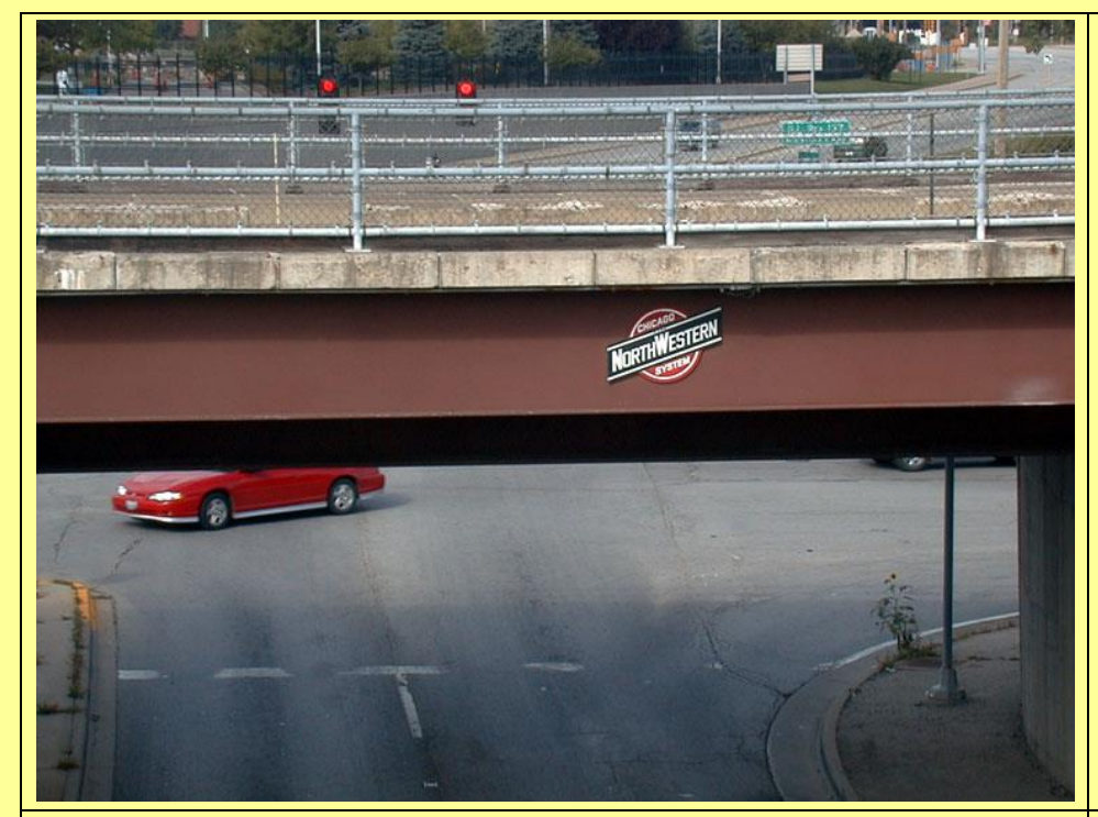
On the bridge over Route 137 just north of the Great Lakes Station. There's one on the other side of the bridge, too.