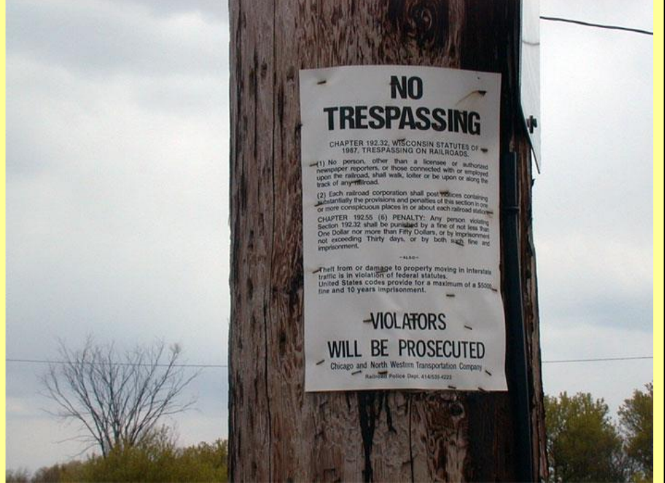
Another one of those signs – this one at Jefferson Junction. They may be cardboard, but the sure are durable!